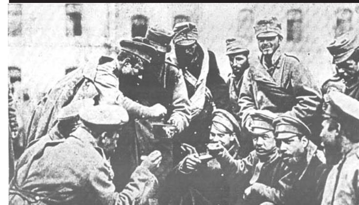
Austrian and Russian soldiers fraternizing at the battle front in 1917

Read also our press on INTERNET http://www.geocities.com/paris/6368/